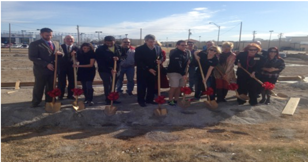
Pictured Above: Apollo Hospitality Firm and Anytime Fitness Ownership Team

Apollo Hospitality Firm had their groundbreaking ceremony for their corporate office on Tuesday January 14 th . The corporate office groundwork has started. The projected date of opening is spring 2014. Apollo is very excited about this new addition. The office strip currently also features other business such as Anytime Fitness and another unannounced business at this time.