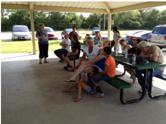
APOLLO TEAM MEMBERS ENJOING COMPANY PICNIC

Its that time of the year where all 3 Ardmore hotels: La Quinta Inn & Suites Central, Candlewood Suites, and La Quinta Inn North got together to enjoy a fun day out at the company picnic with their families and co-workers at Ardmore Regional Park at Lake Pavilion in Ardmore, Oklahoma. The night consisted of grilling, playing games, and showing our teams how much we appreciate their hard work. Displayed below are pictures from the night